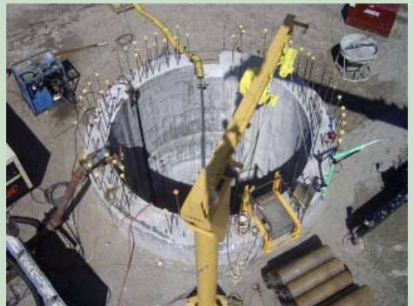
Photo showing aerial view of horizontal collector well.

The collector well will provide natural filtration for pre-treatment and will increase supply reliability under low river flows and icing conditions on the river.