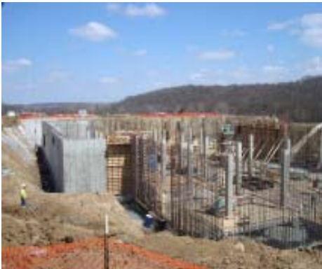
New treatment facility begins to take shape.