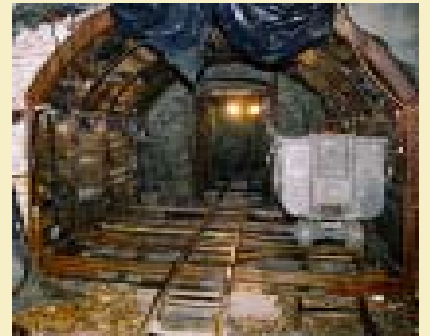
Photo showing conditions inside the Kansas River tunnel and boring equipment used to excavate the tunnel shaft.

When complete, the tunnel will reach 1,400 feet in length and will span the Kansas River. The transmission main is scheduled to be put into service in conjunction with the completion of Phase V in 2009.