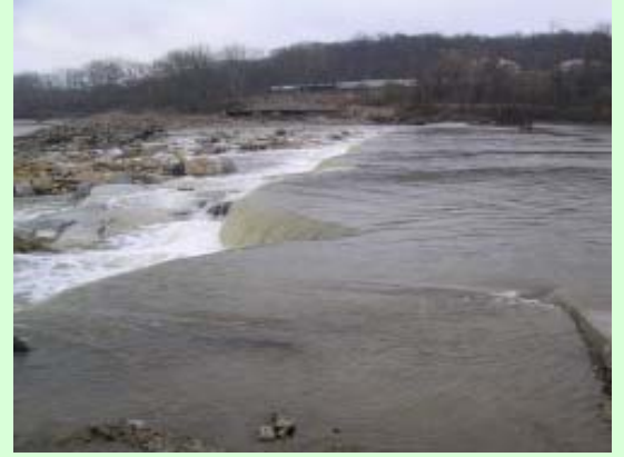
Water flowing over the recently constructed lower cells of the new weir.

The existing diversion rock jetty, built in the early 1970's, will be demolished once the new structure has been completed.