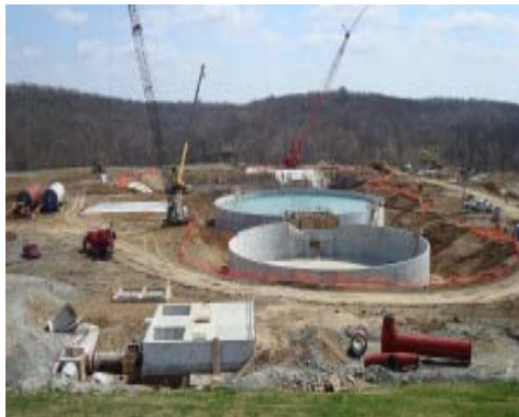
Photo showing contact basins for future water treatment.