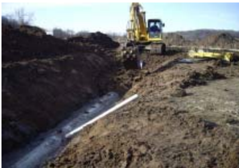
Installation of 60" transmission main along pipeline route.